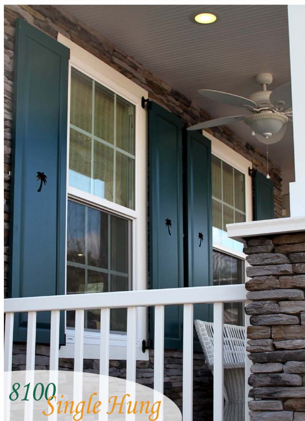
8100 Single Hung