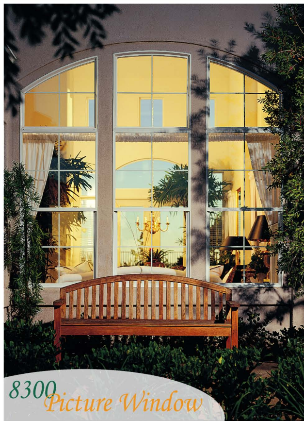
8300 Picture Window