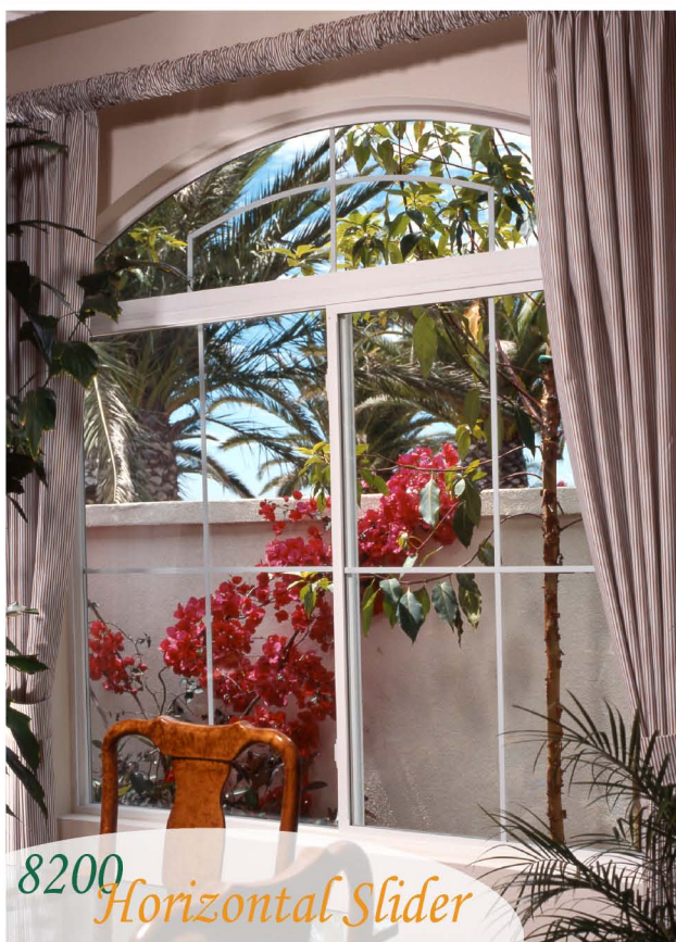
8200 Horizontal Slider