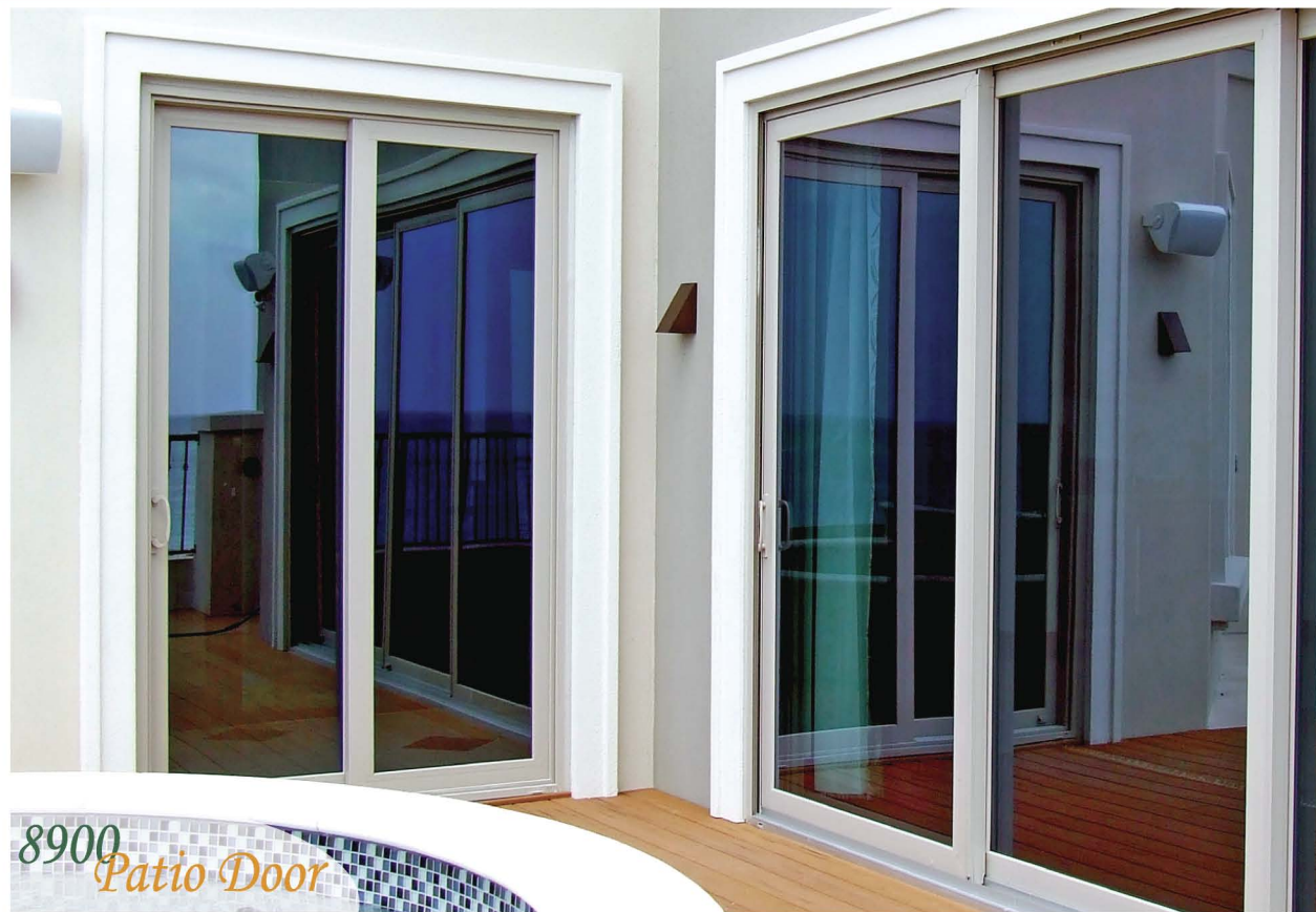
8900 Patio Door