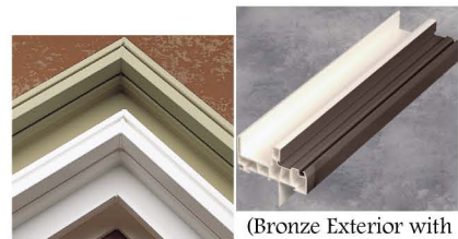
(Bronze Exterior with White Interior)