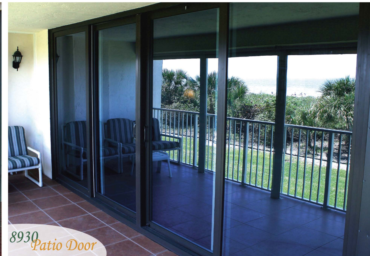
8930 Patio Door