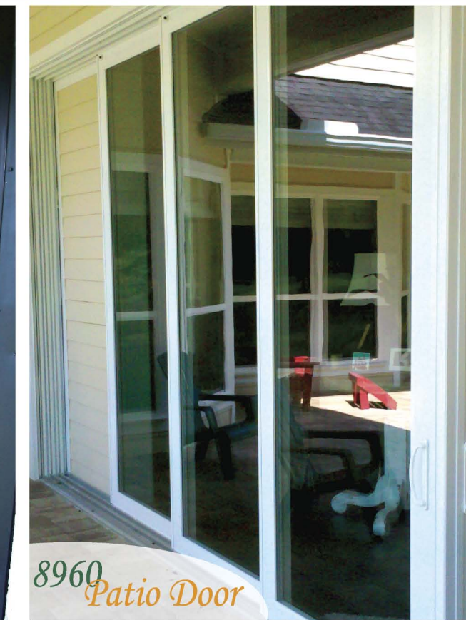
8960 Patio Door